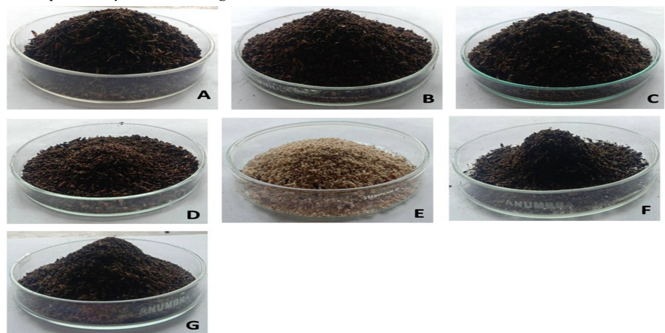
Plate 2: Appearance of the end-substrate of organic waste materials used in the study (A) poultry manure and rice bran mixture (B) goat manure and rice bran mixture (C) rabbit droppings (D) soybean meal (E) coconut scrapings (F) vegetable and fruit waste mixture (G) cow dung

Remarks: Mean values in each column followed by the same letter are not significantly difference at 5% probability level according to DMRT