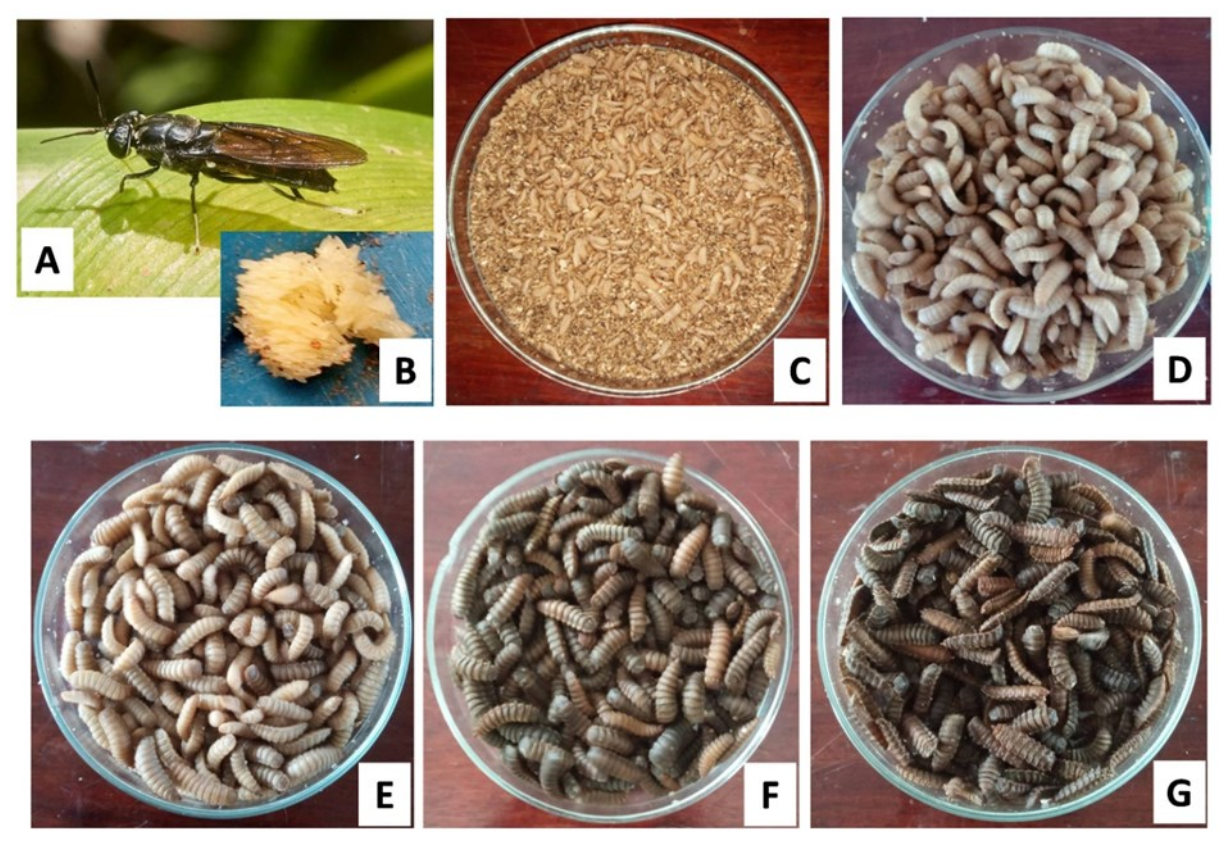
Plate 1: Different stages of the life cycle of black soldier fly (A) adult black soldier fly (B) egg mass (C) 2^{nd} instar (D) 3^{rd} instar (E) 4^{th} & 5^{th} instar (F) prepupae (G) pupae

The organic wastes including cow dung, goat manure, rabbit droppings, coconut scrapings, poultry manure, rice bran, vegetable and food wastes and soybean residuals were all sourced locally. Cow dung, goat manure and poultry manure were collected respectively from cat-